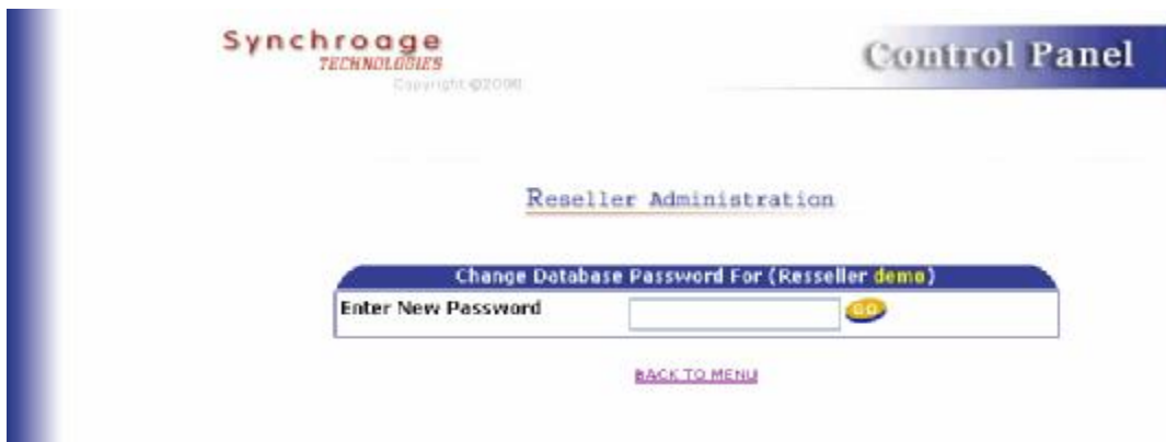
Screen Shot 7

Click on Change Password Link (in Screen Shot 5) it will give you following Screen (Screen Shot 7) where you can Enter your New Reseller Password and Click GO.