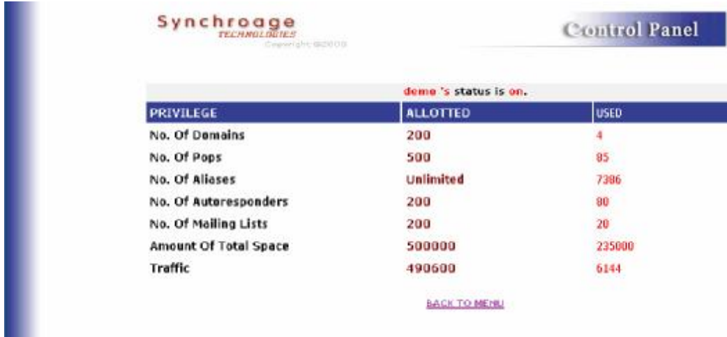
Screen Shot 6

To check you Reseller Status; Click on Reseller Status (Screen Shot 5) and you will get following Screen.