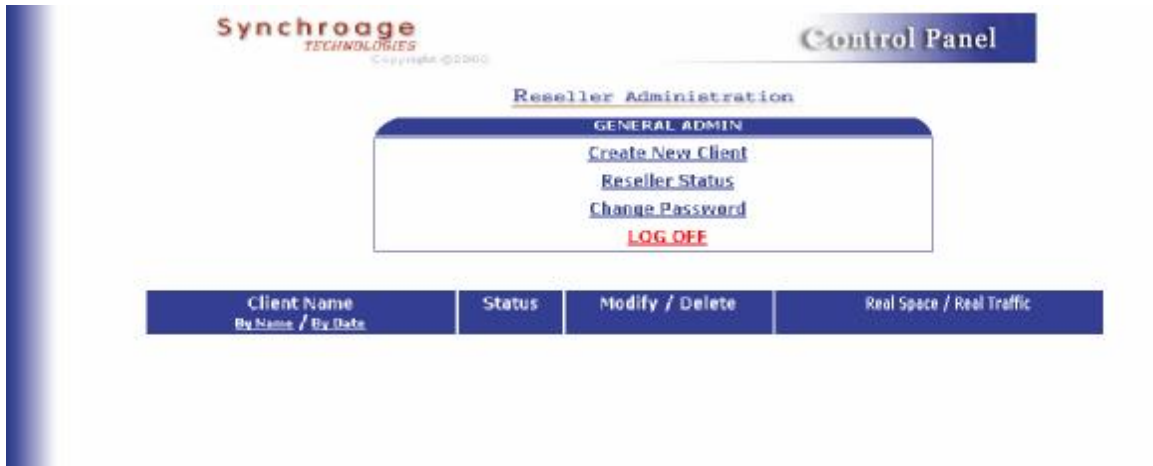
Screen Shot 2

NOTE: It is Very Important to Log Off after managing your Clients. (Security Purpose).