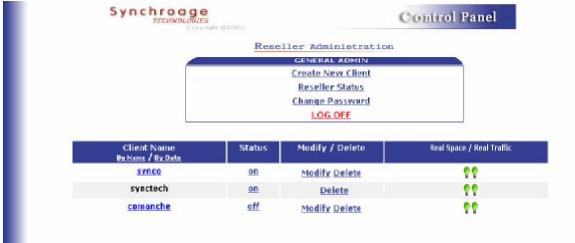
Screen Shot 5

You will get following screen after mapping a Domain. Here you can Modify or Delete a Domain. (Screen Shot 5)